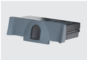
POWER CARTRIDGE (BATTERY)