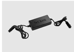
DC POWER SUPPLY