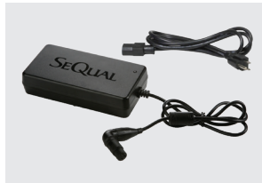
AC POWER SUPPLY